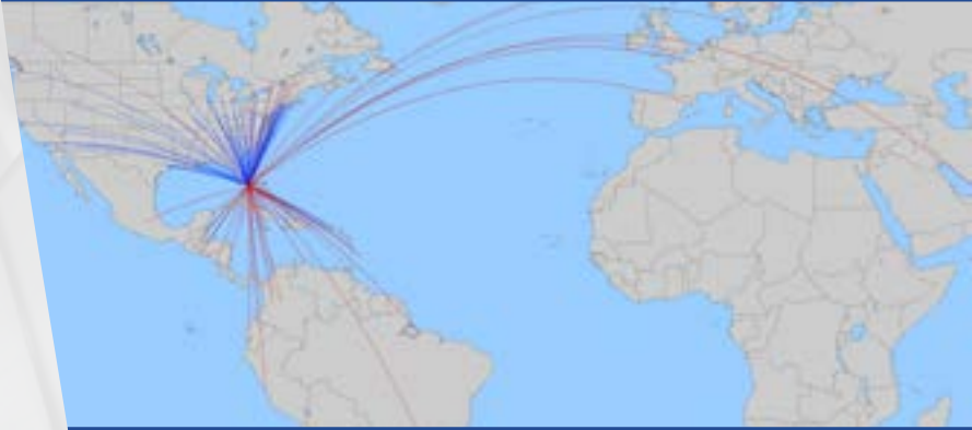
FLL Connectivity to the World