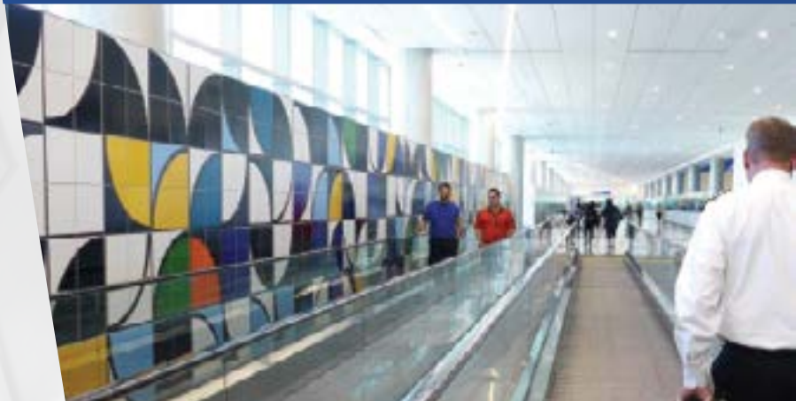
Centro de Formacao by artist Sarah Morris