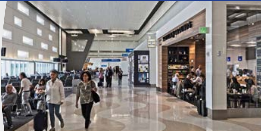
Terminal 4 Concourse G