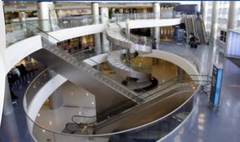
Rental Car Center