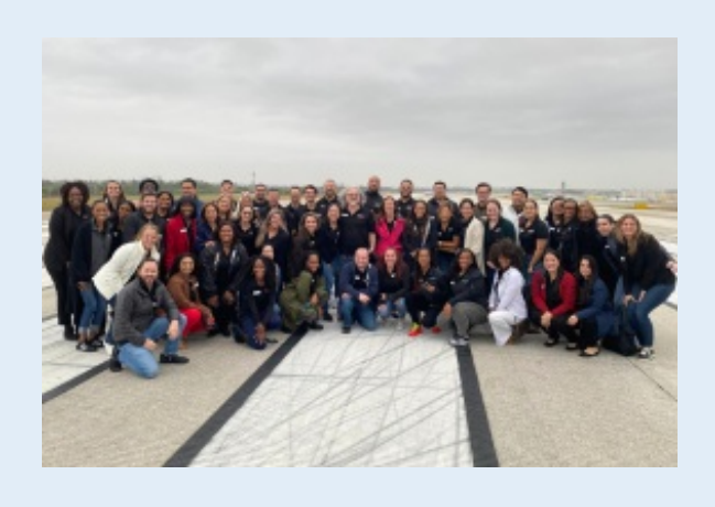
Posing on the runway

On January 11, Leadership Broward Class XLII visited FLL and received an airside tour of the airport. Leadership Broward is an educational program launched by the Greater Fort Lauderdale Chamber of Commerce to enhance leadership skills and provide unique experiences for established community leaders.