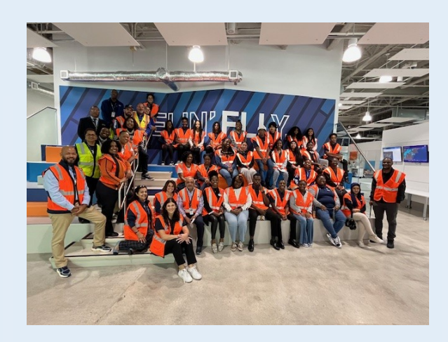
A close-up at airline operations

On January 18, JetBlue hosted a Career Bound event in conjunction with Junior Achievement of South Florida to give 25 students from Fort Lauderdale's Stranahan High School a behind-the-scenes tour of the airport's operation at FLL. The students, accompanied by teachers and chaperones, also had the opportunity to connect with JetBlue crewmembers from various workgroups to learn about their roles and the paths they took to get there. The Junior Achievement program offers students in-depth knowledge of a specific industry, introducing them to companies and career opportunities within that sector.