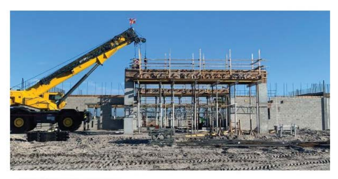
Aviation Center under construction