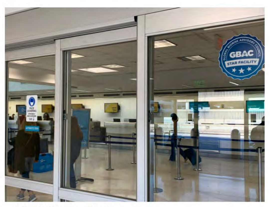
GBAC Star Facility Accreditation