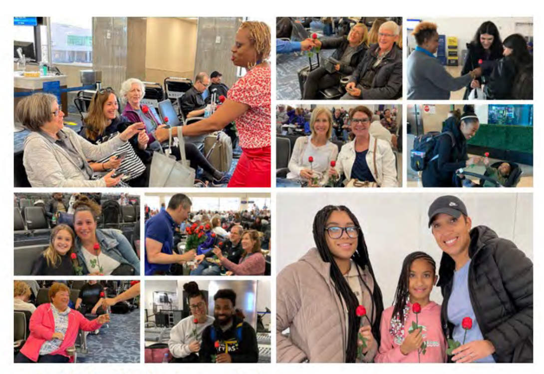
St. Valentine's Appreciation