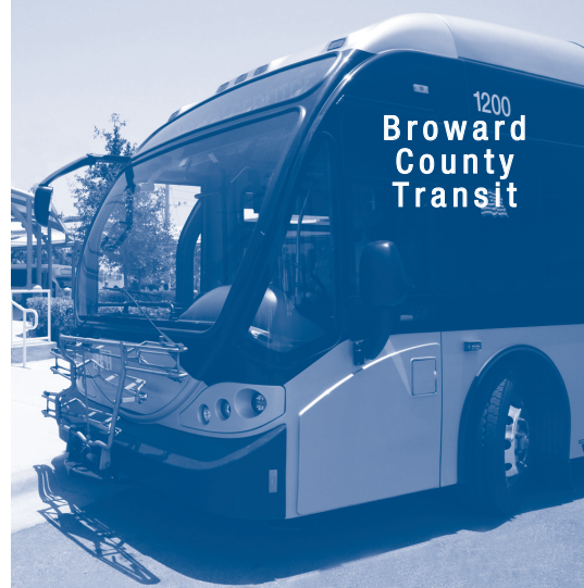
Pembroke Lakes Mall to Sawgrass Mills Mall