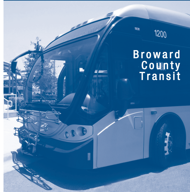
Young Circle to Broward Central Terminal