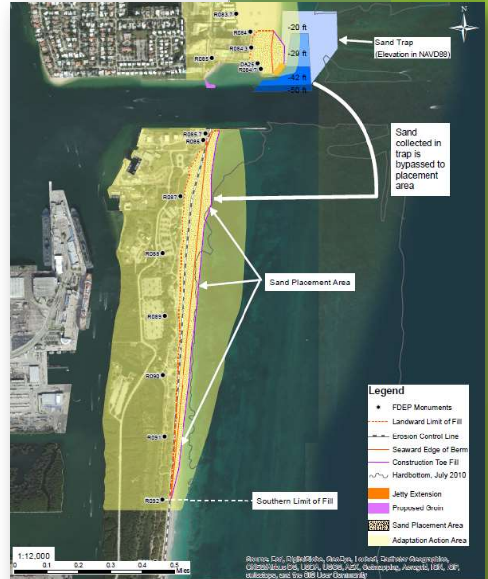
Figure 1: Broward County Port Everglades Entrance Sand Bypass Project Date of Photography: December 2013 Map provided for informational purposes only