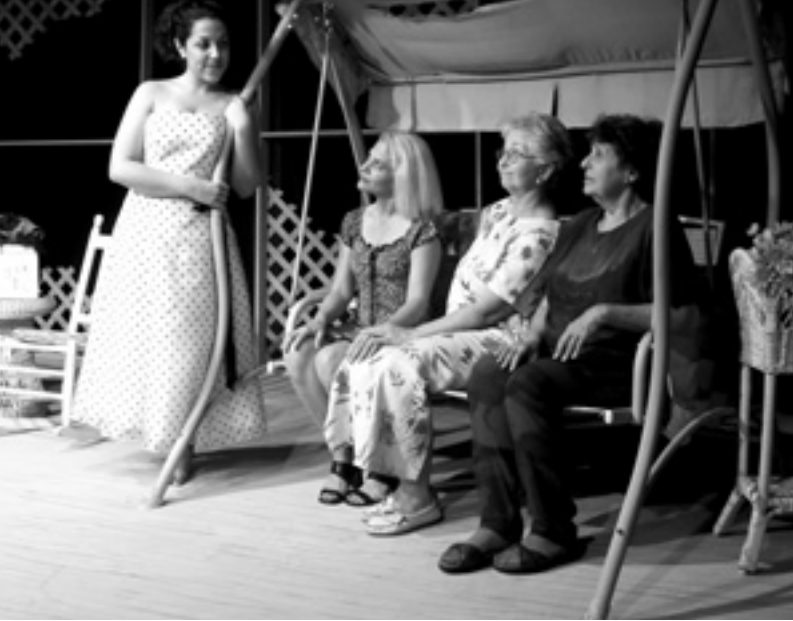
Women's Theatre Project, August 10-27, PPTOPA at Cooper City Theatre