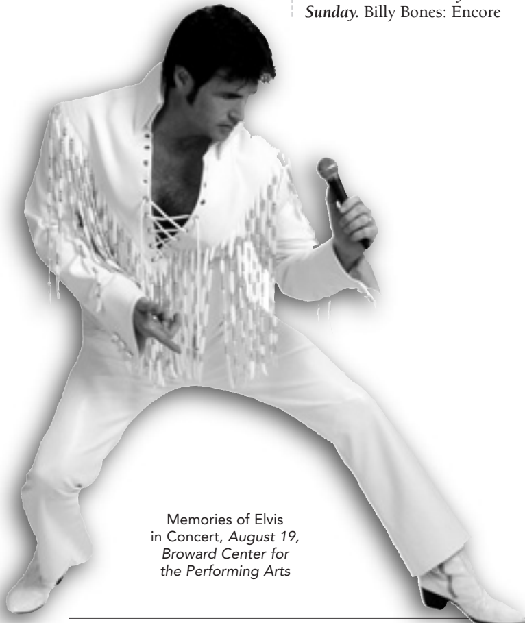
Memories of Elvis in Concert, August 19, Broward Center for the Performing Arts

ALIENS: Worlds of Possibilities. Museum of Discovery and Science and Blockbuster IMAX®