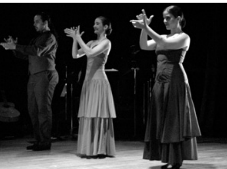
Calle Flamenca, Bailes Ferrer, August 5 and 6, Broward Center for the Performing Arts

Theater: Pirates of Penzance. Fort Lauderdale Children's Theatre. Hollywood Playhouse. 954-763-6701.