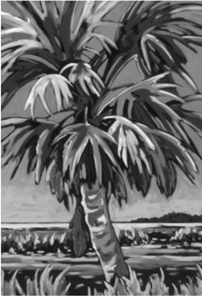
Art by Sally Evans, 19th Annual Las Olas Labor Day Weekend Art Fair, September 2-3