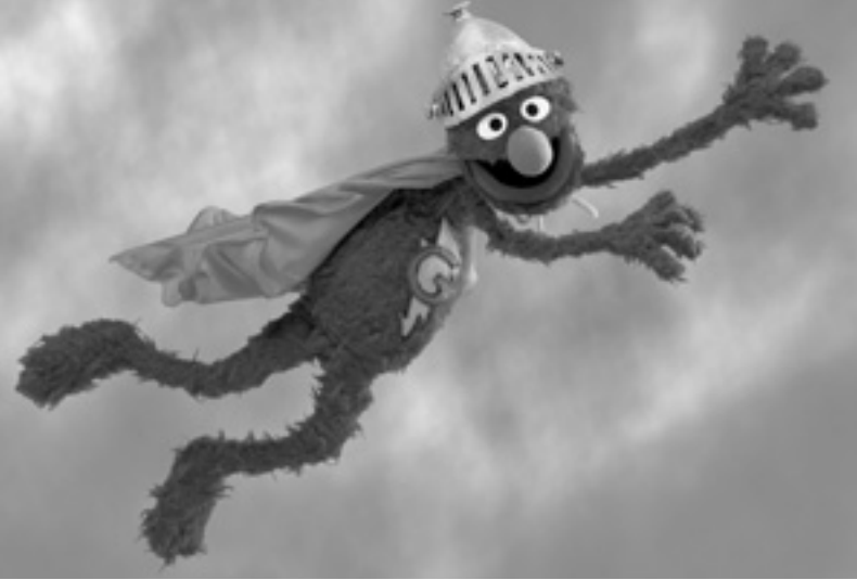
Sesame Street Live! Super Grover! September 29 - October 1, Broward Center for the Performing Arts