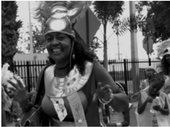
13th Annual Unifest Celebration, June 3, City of Lauderdale Lakes and Greater Caribbean American Chamber of Commerce