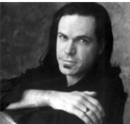
Jazz Impressions Concert with vocalist Kurt Elling, June 16, South Florida JAZZ, Rose and Alfred Miniaci Performing Arts Center

The Metropolitan Opera Goes to the Movies. 6 p.m. Fort Lauderdale International Film Festival. Cinema Paradiso. 954-525-FILM.