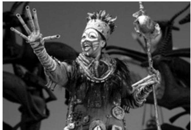
Disney's The Lion King, April 19 - June 3, Broadway Across America, Broward Center for the Performing Arts

Swimming In The Shallows. The Public Theatre of South Florida. The Soref JCC. 954-427-0784.