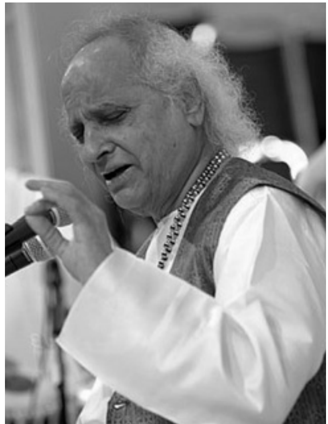
Indian Classical Vocal Concert featuring Sangeet Martland Pt. Jasraj, June 30, Association of Performing Arts of India, Broward Center for the Performing Arts

Spring Pops Concert. 7:30 p.m. Coral Ridge Concert Series. Coral Ridge Presbyterian Church. 954-491-1103.