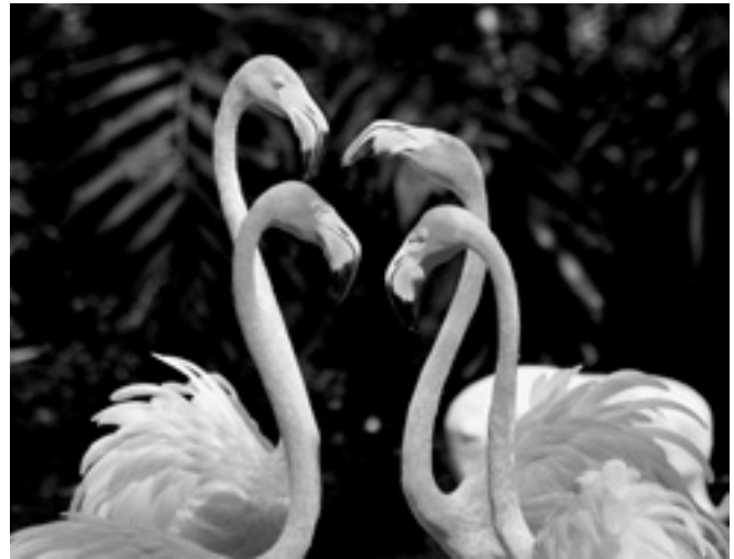
Flamingo Gardens & Wildlife Sanctuary

Samson et Dalila by Camille Saint-Saëns. Performed in French with English and Spanish translations. 8 p.m. Florida Grand Opera. Broward Center for the Performing Arts. 954-462-0222.