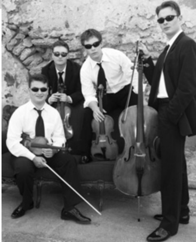
Jerusalem String Quartet, April 16, presented by the Concert Association of Florida, Broward Center for the Performing Arts

Bilingual Mondays/Bilingüe Lunes. 6 - 8 p.m. Broward