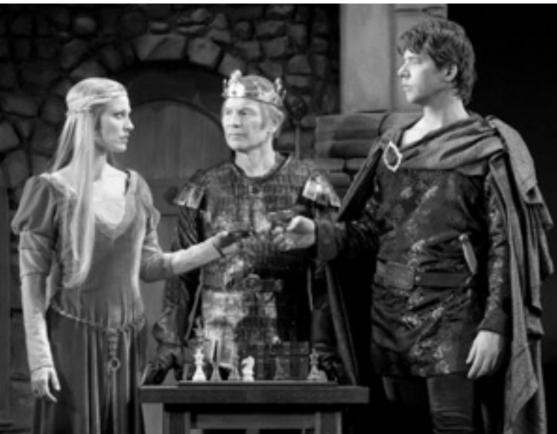
Camelot, June 12-24, Broadway Across America, Broward Center for the Performing Arts