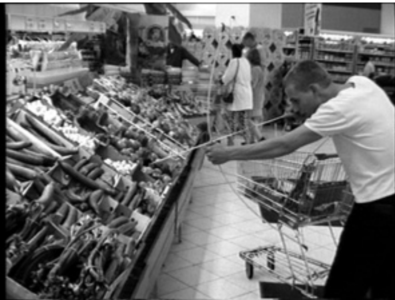
Christian Jankowski, The Hunt, 1992, single-channel video with sound, 1 minute, 11 seconds; from Situation Comedy: Humor in Recent Art, June 1 - September 3, Museum of Art | Fort Lauderdale