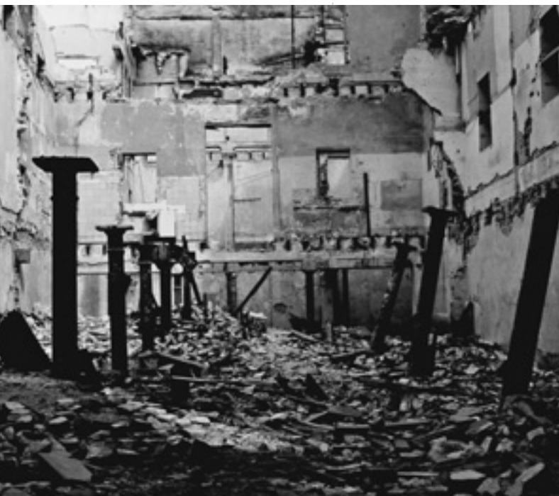
Carlos Garaicoa, Solarium , C-print, 39-3/4" x 49-1/4", 1997; from Unbroken Ties: Dialogues in Cuban Art , May 11 - September 24, Museum of Art | Fort Lauderdale

Everglades Eyes: How Our Children See Our Watery Landscape. Art Opening and Social, April 13, 7 p.m. Old Davie School Historical Museum. 954-797-1044.