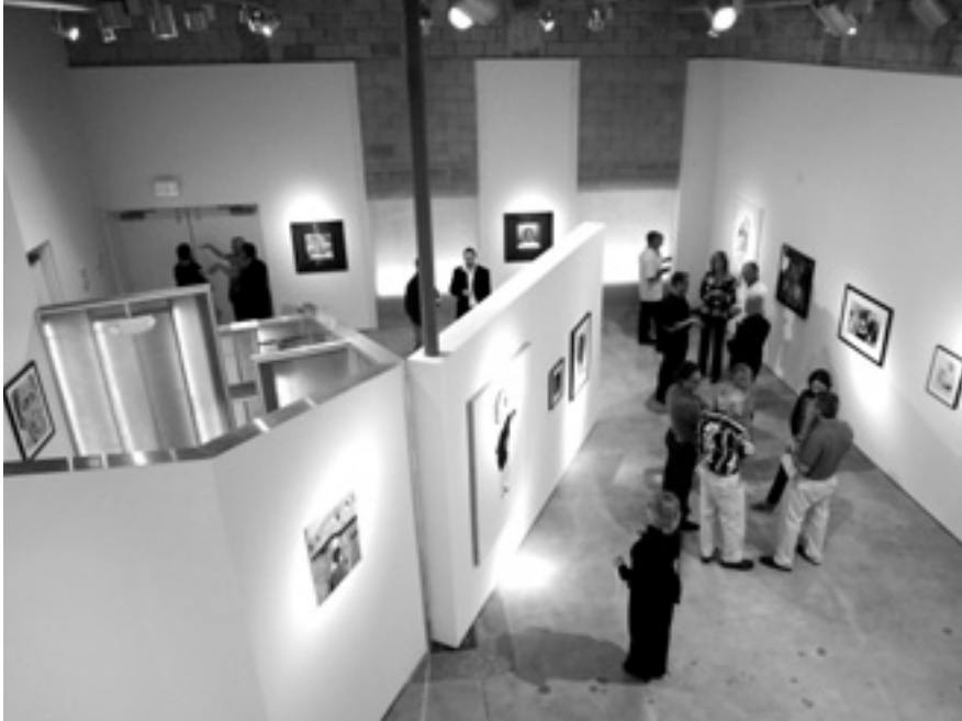
A view inside the Girls' Club