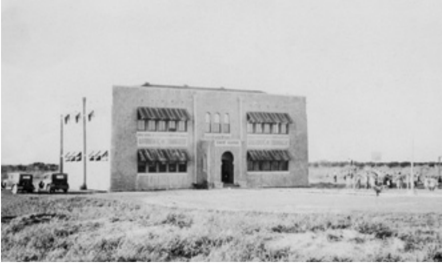
The Old Davie School opened its doors in 1918.

90 students. This historic structure was the first permanent school in the Everglades and is now Broward County's oldest existing school building. It was in continuous use as a school until 1980.