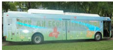
Hybrid Electric Transit Bus.