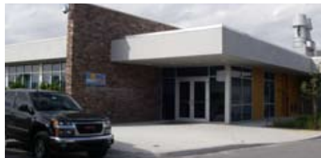
Environmental Monitoring Laboratory built to LEED® standards.