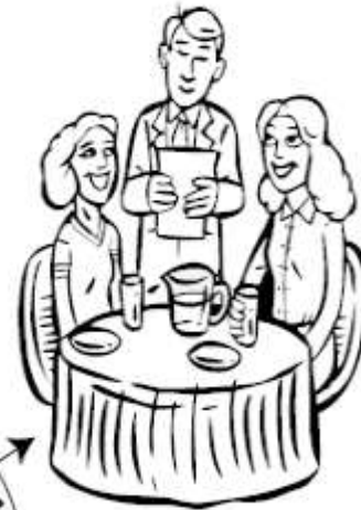
Support for the Economy