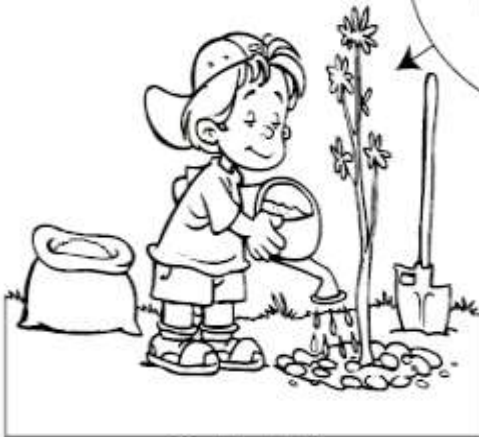
Quality of Life