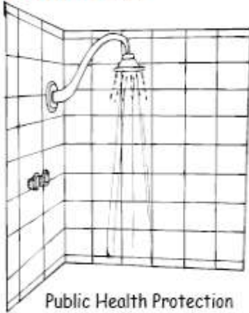
Public Health Protection

Color these examples of ways we use water daily. Can you think of more ways that tap water delivers?