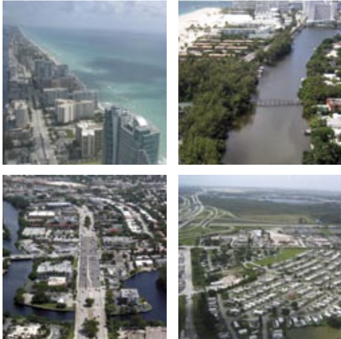
Four aerial images of Broward County show various forms of development and a ubiquitous presence of water.

This Guidebook represents a county-wide effort. It is intended to provide guidelines that describe specific recommendations for both public and private entities to use as they develop or redevelop throughout Broward County, and in their efforts to achieve the following five goals and objectives: