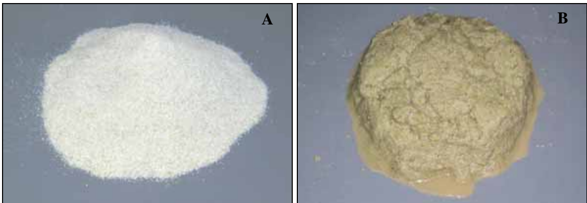
Figure 4. Bulk Glass Cullet from Recycle America Alliance. (A) sample when dry (light greenish gray 10Y 8/1), (B) sample when wet (pale olive 5Y 6/3).