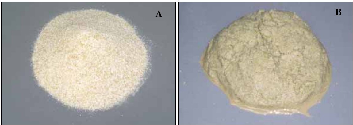
Figure 3. Bulk Glass Cullet from Glass Aggregate Systems. (A) sample when dry (pale yellow 2.5Y 8/3), (B) sample when wet (pale olive 5Y 6/4).