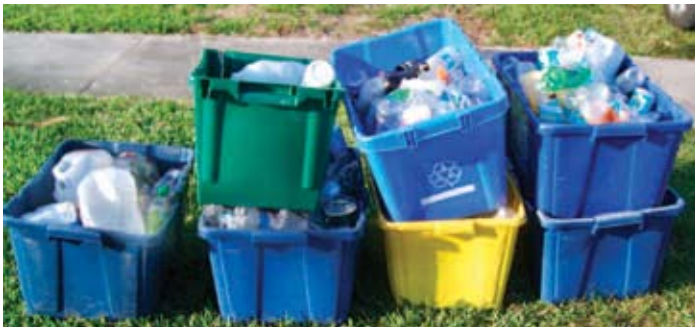
In Hollywood, Puccio Plumbing adopts a portion of Johnson Street that has two bus stops where litter accumulates. They collect and separate about 7 full bins every other week! Pictured are the bins from a cleanup in January.

Look for upcoming information about America Recycles Day this fall. Adopt-A-Street is partnering to hold cleanups throughout the County during America Recycles week. Groups will be asked to track litter that is removed, and to separate recyclables. Adopt-A-Street groups and Broward County School groups will be invited to participate. America Recycles Day is set for November 15, 2007.