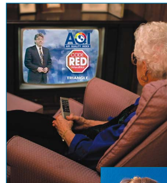
If smoke is affecting your area, check your local media for information on air quality and how to protect your health.

Help keep particle levels inside lower. When smoke levels are high, try to avoid using anything that burns, such as wood fireplaces, gas logs, gas stoves – and even candles! Don't vacuum. That stirs up particles already inside your home. And don't smoke. That puts even more pollution in your lungs, and in the lungs of people around you.