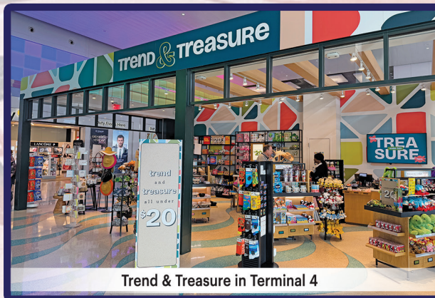
Trend & Treasure in Terminal 4