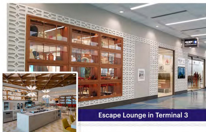
Escape Lounge in Terminal 3