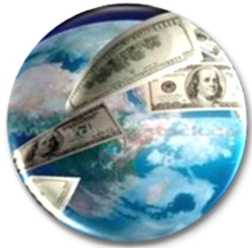
Economic Development & International Trade