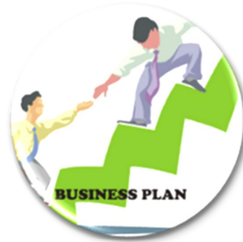
Small Business Development