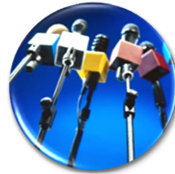
Community Relations & Outreach