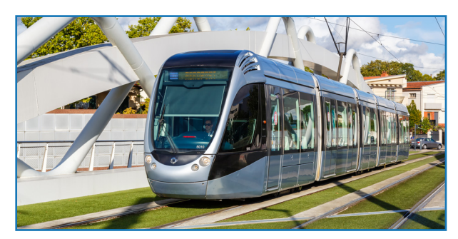
Light Rail Transit, or LRT, is passenger rail that uses modern rail cars in urban areas, often in dedicated lanes to provide frequent, reliable service.