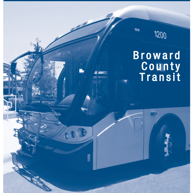
Young Circle to Broward Central Terminal