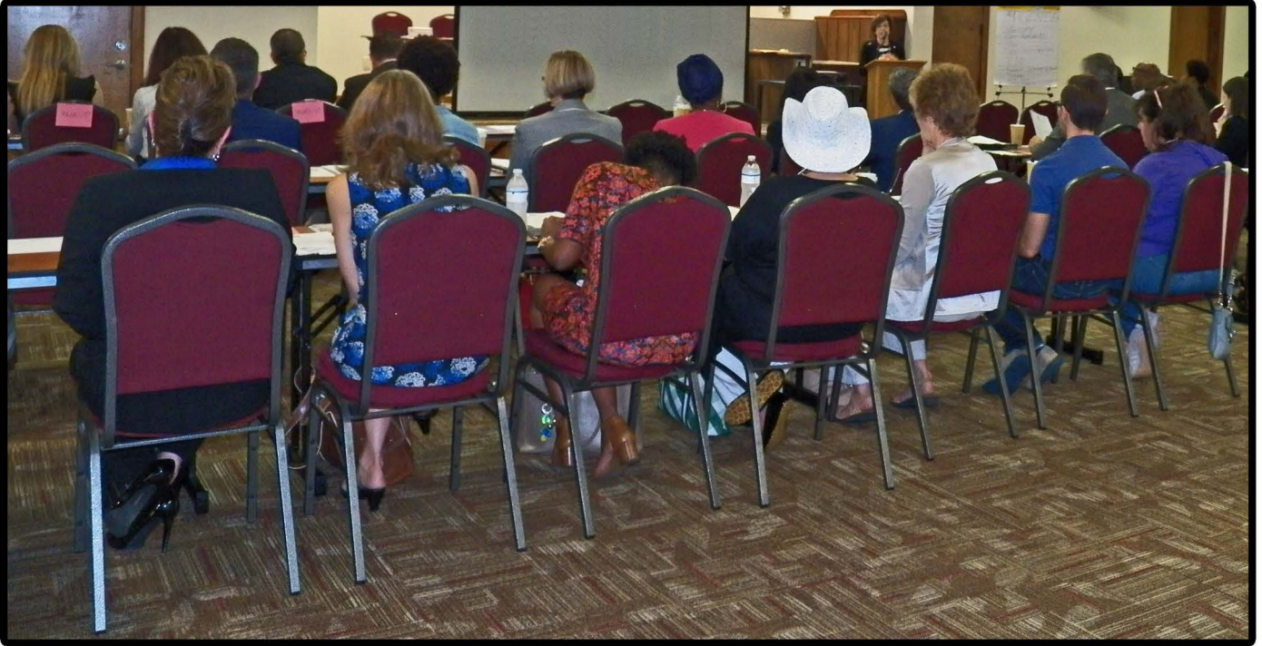
Workshop attendees viewed the new BHC video