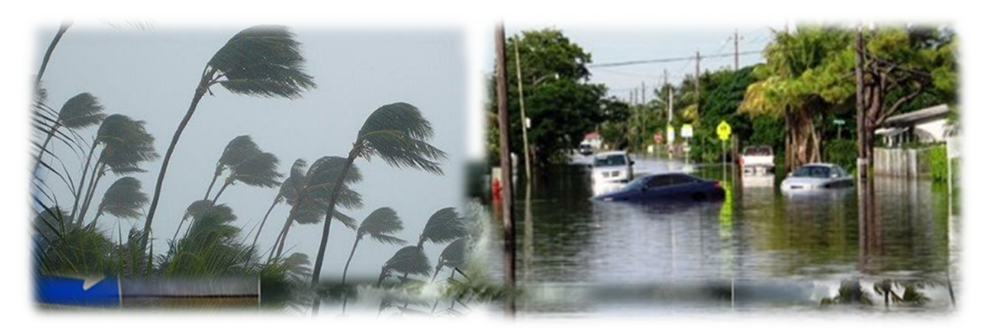
South Florida and Broward County are most vulnerable to the threat of hurricanes and storm surge.

Hurricanes, tornadoes, extreme heat, floods, fires, storm surge, and other natural disasters may threaten the safety of Broward County's residents, visitors, and properties. South Florida is most vulnerable to the threat of hurricanes and storm surge. Hurricane season begins on June 1 and ends on November 30, but planning and preparation are year-round activities. Broward County must work to protect over 1.9 million permanent residents, 15 million annual visitors, billions of dollars in tangible properties, 23 miles of beaches, as well as over 150,000 coastal residents and mobile home occupants living in mandatory evacuation zones. Accommodations must be made to protect Broward's vulnerable population groups such as the homeless, the elderly, and the physically challenged. Broward County's goal is to reduce or eliminate the long-term risk to life and property from hazardous events. Broward County and its municipalities, in coordination with partner agencies, should put in place a post-disaster recovery and redevelopment strategy to ease the rebuilding process and remove potential obstacles that would support a sustainable community after a major disaster.