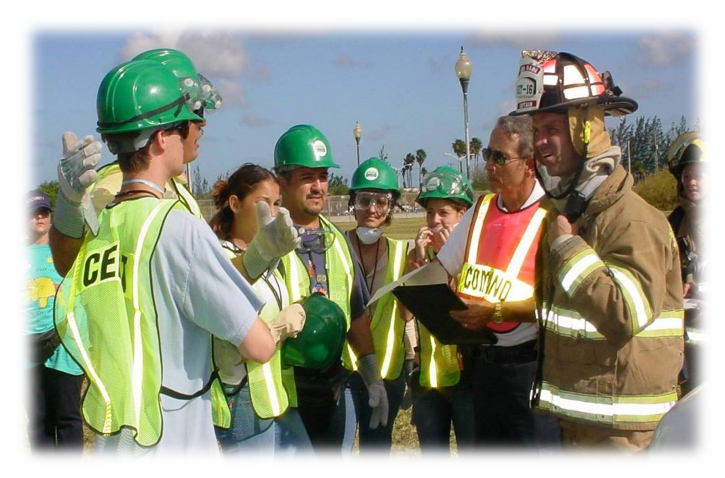
The Community Emergency Response Teams (CERT) Program educates people about disaster preparedness for hazards and trains them in basic disaster response skills, such as fire safety, search and rescue, team organization, and disaster medical operations.

POLICY ND7.6 Broward County shall develop strategies and policies to address post disaster redevelopment issues, such as: