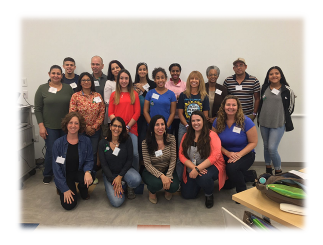
Climate Ambassador Training Participants learn about local climate impacts and receive resources to help spread climate change awareness in our community.