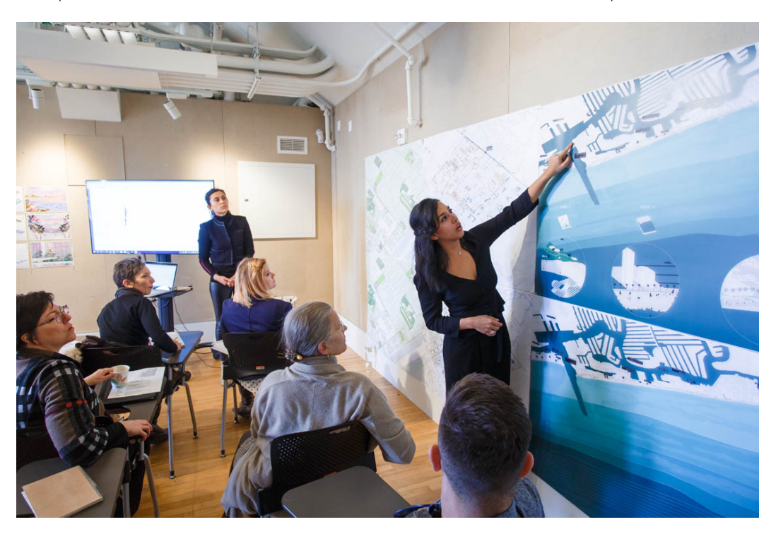
University Partnerships University of Toronto students presenting design-based climate adaptation strategies for various sites across Broward County.

POLICY CC5.10 Broward County shall promote partnerships between local government agencies, universities, professionals, and practitioners to foster an environment for connecting scientific research and education with practical applications that will contribute to the resiliency and adaptation within the built and natural environments to the impacts of climate change.