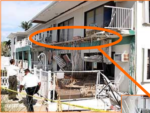
2006 4564 El Mar Dr. Lauderdale by the Sea, Fl. Balcony Collapse