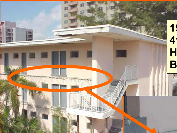
1996 4111 South Ocean Drive, Hollywood, Fl. Balcony Collapse