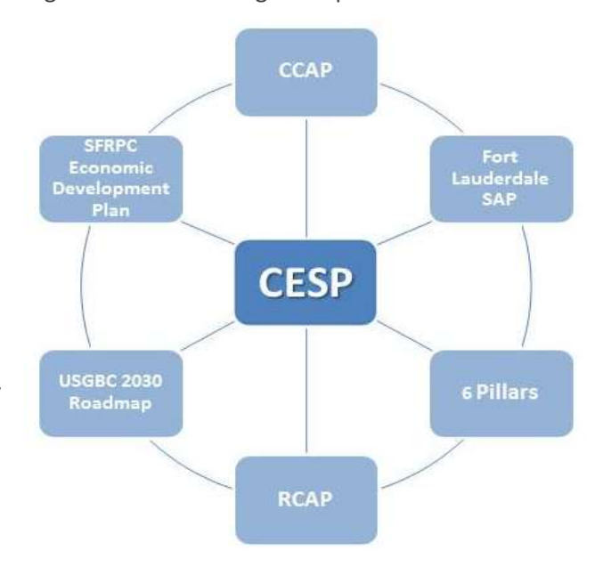
Figure 2 - Local and Regional Plans Assessed for CESP

government, adding goals for using renewable energy, reduction of energy usage, and incorporating renewable energy projects into buildings and operations." The Resolution which passed on February 4, 2014, sets goals for 20% use of energy from renewable energy sources and for 2.5% annual improvements in the energy efficiency of County buildings by 2020. To advance the resolution, a Broward County Renewable Energy Action Plan was developed to advance and encourage future renewable energy projects within county operations symbiotically with the CESP. Both plans support Broward County goals through reduction in total energy use, and in furtherance of the community's greenhouse gas (GHG) targets.