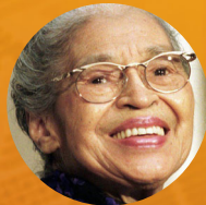
Rosa Parks Civil Rights Activist