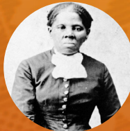
Harriet Tubman Abolitionist and Political Activist