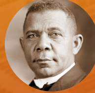
Booker T. Washington 19 th Century Intellectual