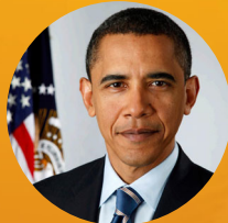
Barack Obama 44 th President of the United States