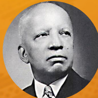
Dr. Carter Woodson "Father of Black History"