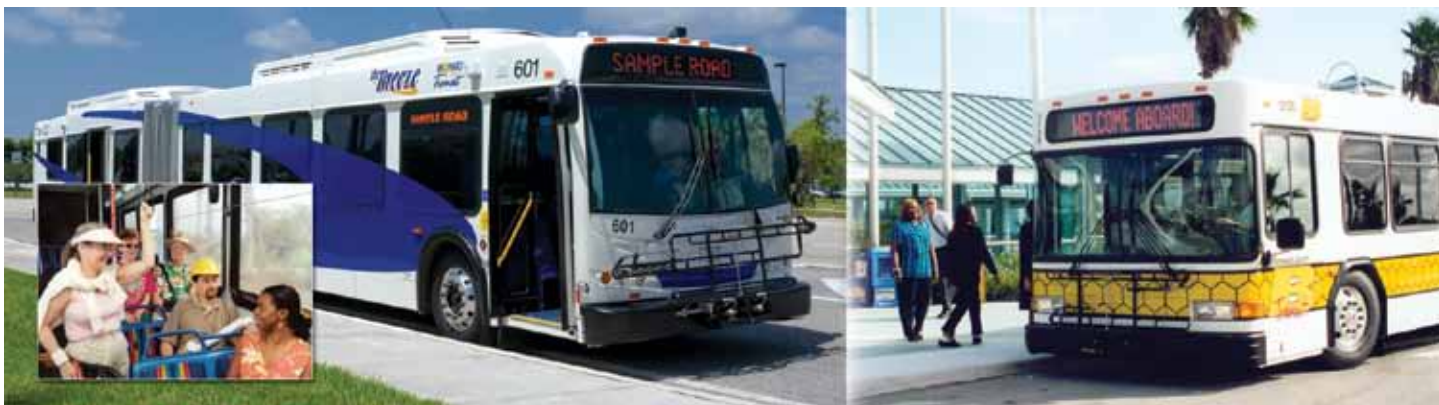
Give Your Car a Break - Leave your car at home. Walk, bike, carpool, or use mass transit.