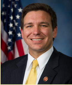
Governor Ron DeSantis

ron.desantis@eog.myflorida.com www.flgov.com