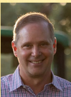
Commissioner Agriculture & Consumer Services Wilton Simpson

Plaza Level 11, The Capitol 400 South Monroe Street Tallahassee, FL 32399 (850) 413-3100 Fax: (850) 413-2950