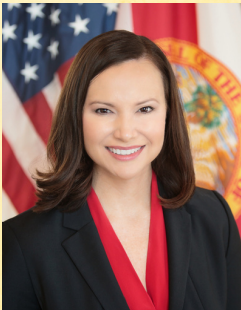
Attorney General Ashley Moody

Plaza Level 05, The Capitol 400 South Monroe Street Tallahassee, FL 32399 (850) 488-4711 Fax: (850) 921-6114