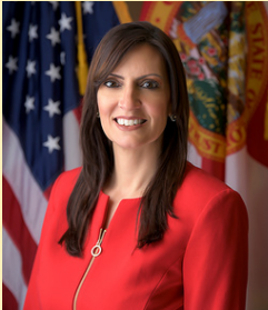
Lieutenant Governor Jeanette Nuñez

Plaza Level 05, The Capitol 400 South Monroe Street Tallahassee, FL 32399 (850) 488-7146 Fax: (850) 487-0801