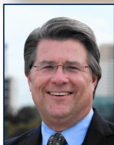
Senator Gary Farmer