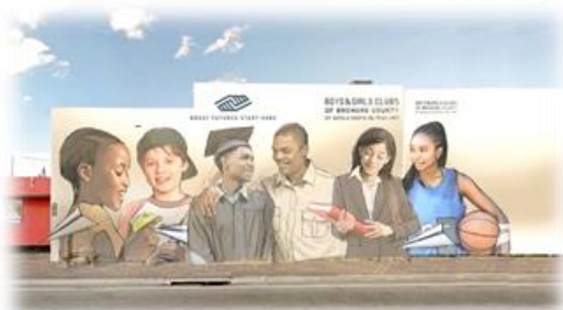
Mural Design for Harold Reitman Boys and Girls Club facing West Broward Blvd.

The Cultural Division is investing more than $234,000 in additional public art projects throughout the District with installations planned for 2019. Artworks celebrate the unique culture of the surrounding neighborhoods. Projects include a mural on the Harold Reitman Boys and Girls Club that expresses the BGC’s mission to grow future leaders.