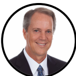
District 6 Beam Furr