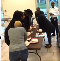
BMSD CERT Workshop Basic CPR Training