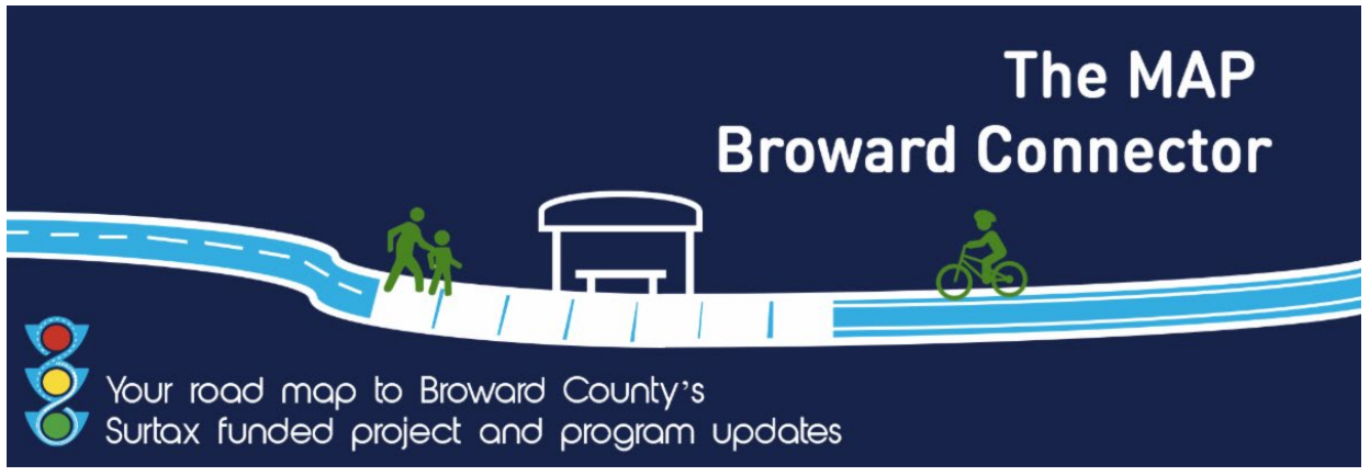
April 7, 2021 | Issue One, Navigating MAP Broward