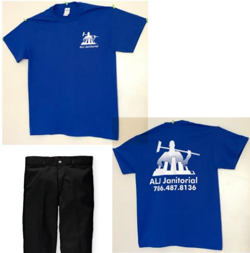
ALJ SERVICES COMPANY UNIFORM

Professionalism and security are of utmost importance to ALJ.