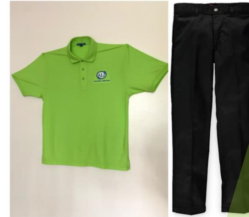
ALJ SERVICES COMPANY UNIFORM