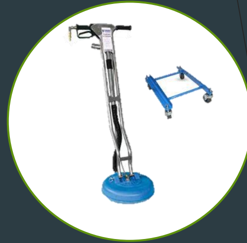
20\" Hybrid Scrubber