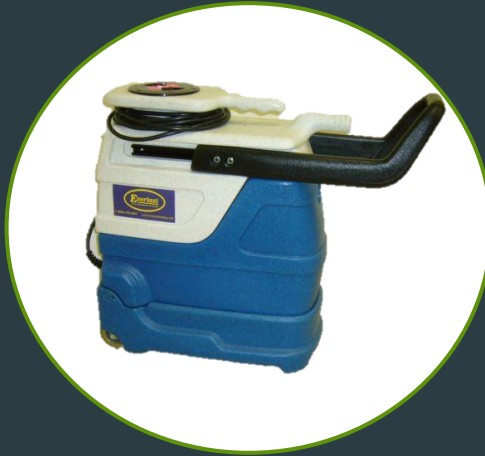
Champ 3-Gallon Spot Extractor