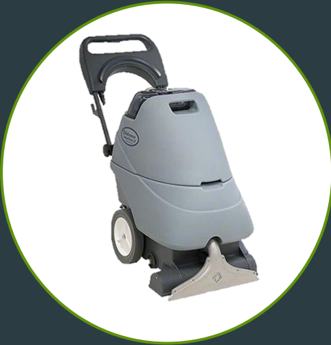
Mytee® Speedster Deluxe™ Extractor