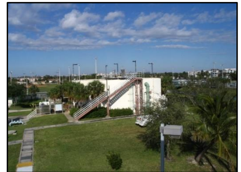
Water & Sewer