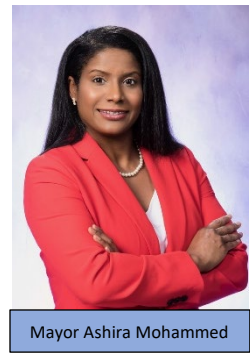
Mayor Ashira Mohammed