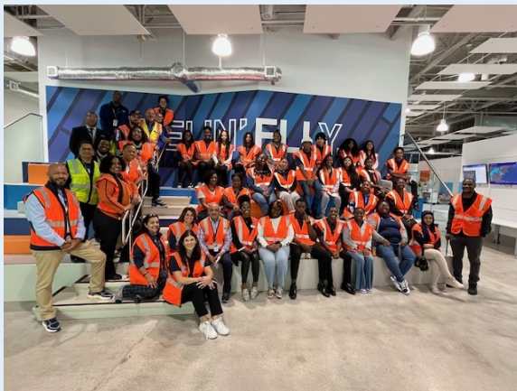
A close-up at airline operations

On January 18, JetBlue hosted a Career Bound event in conjunction with Junior Achievement of South Florida to give 25 students from Fort Lauderdale’s Stranahan High School a behind-the-scenes tour of the airport’s operation at FLL. The students, accompanied by teachers and chaperones, also had the opportunity to connect with JetBlue crewmembers from various workgroups to learn about their roles and the paths they took to get there. The Junior Achievement program offers students in-depth knowledge of a specific industry, introducing them to companies and career opportunities within that sector.