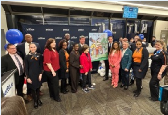
First jet-service in years