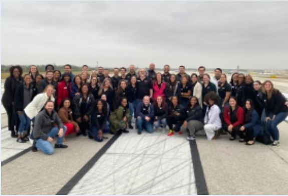
Posing on the runway

On January 11, Leadership Broward Class XLII visited FLL and received an airside tour of the airport. Leadership Broward is an educational program launched by the Greater Fort Lauderdale Chamber of Commerce to enhance leadership skills and provide unique experiences for established community leaders.