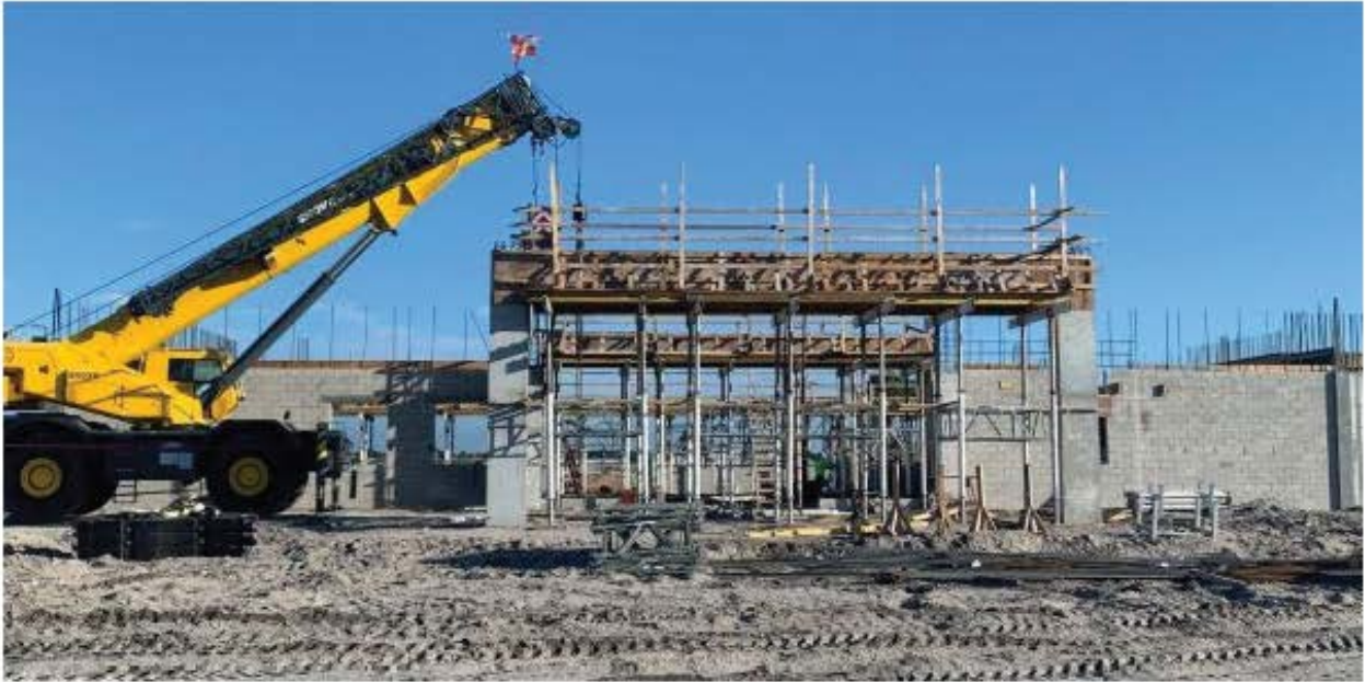
Aviation Center under construction