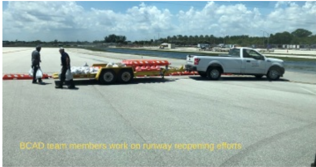
BCAD team members work on runway reopening efforts