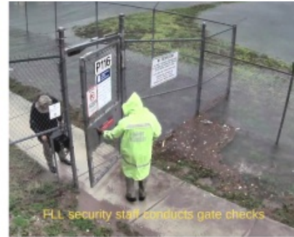
FLL security staff conducts gate checks