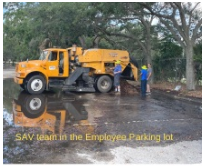
SAV team in the Employee Parking lot