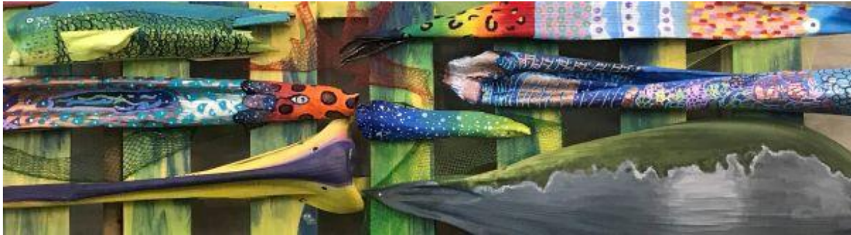
Official Newsletter of Broward County's Fort Lauderdale-Hollywood International Airport