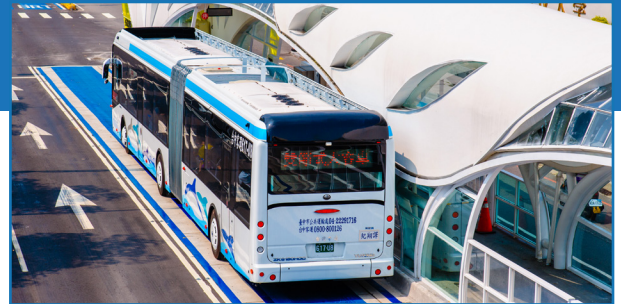
Bus Rapid Transit, or BRT, is high quality bus-based transit that uses modern vehicles and often dedicated lanes or technology to provide faster, more reliable service.