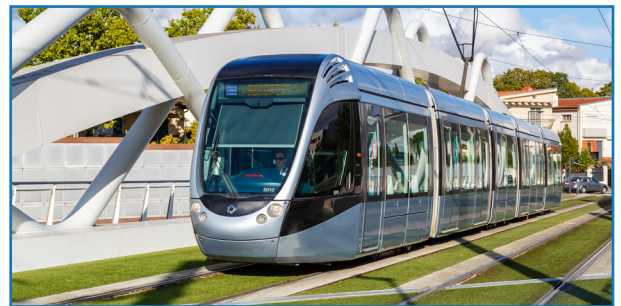
Light Rail Transit, or LRT, is passenger rail that uses modern rail cars in urban areas, often in dedicated lanes to provide frequent, reliable service.