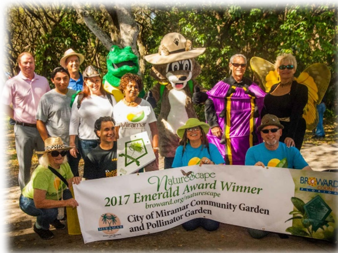
2017 NatureScape Emerald Award Winner

The Broward County Conservation Element provides a framework for the conservation, use, and protection of natural resources, including air, water, water recharge areas, wetlands, water wells, estuarine marshes, soils, beaches, shores, flood plains, rivers, bays, lakes, harbors, fisheries and wildlife, marine habitat, and other natural and environmental resources, and the factors that affect energy conservation. The purpose of the Conservation Element is to promote the conservation, wise use, and protection of Broward County's natural resources. The Conservation Element is a required element of the comprehensive plan as per Section 163.3177, Florida Statutes. Issues concerning conservation of natural resources are also addressed throughout the Comprehensive Plan. The Broward Municipal Services District (BMSD) Future Land Use provides implementation tools to preserve lands for conservation and promote appropriate land uses to minimize the impacts of development on the environment. The Water Management, Climate Change, and Coastal Management Elements also contain policies that support the protection of the County's natural resources.