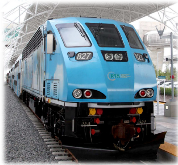
SFRTA operates Tri-Rail, a 72-mile passenger commuter rail line with 18 stations between Mangonia Park and Miami International Airport.

OBJECTIVE T4.3 Broward County will continue to support the maintenance and expansion of regional passenger and freight rail systems.