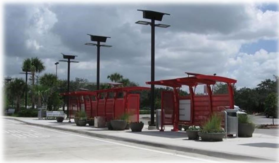
BB&T Center Park and Ride Lot for 95/595 Express Bus Service, an example of successful implementation of Policy T2.5.1

POLICY T2.5.2 Broward County shall provide for an energy efficient roadway network and work to reduce greenhouse gases through implementation of, but not limited to, the following programs, activities, or actions: