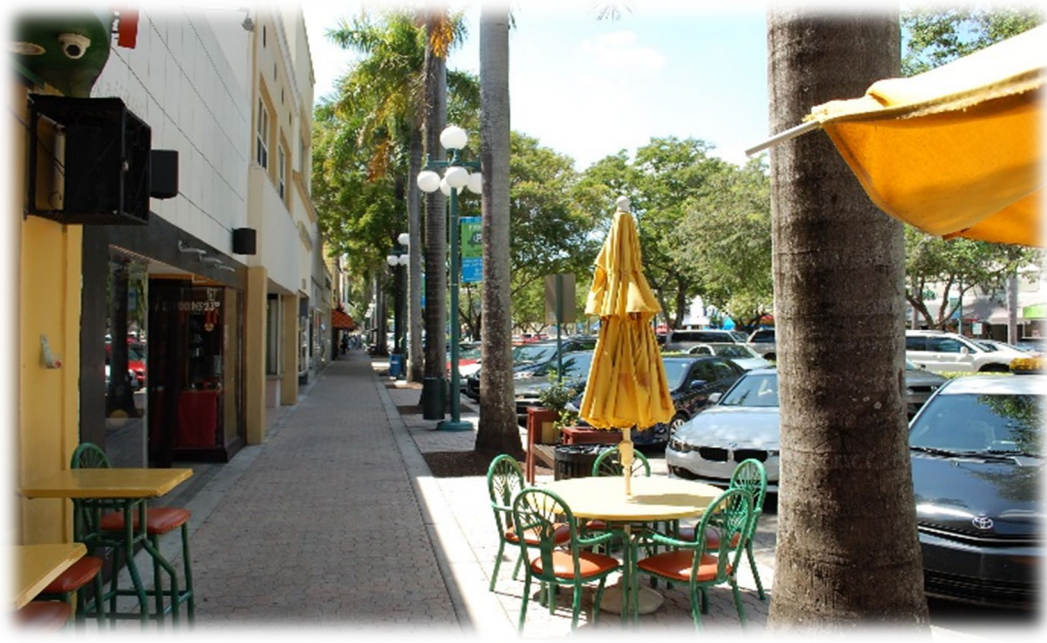
Example of a pedestrian-friendly environment that support Complete Streets Guidelines, Downtown Hollywood, described in Policy T1.1.5

POLICY T1.1.6 Broward County shall support and incorporate into the County's codes the utilization of context sensitive techniques to enhance bicycling safety and comfort, consistent with the Broward Complete Streets Guidelines, including, but not limited to: