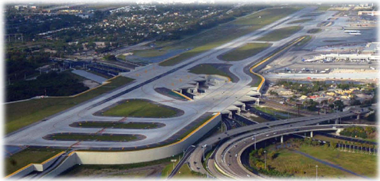
The 8,000 foot south runway at Fort Lauderdale-Hollywood International Airport which opened in 2014, was constructed over Federal Highway and the FEC rail. Right-of-way under the runway was preserved for a future light rail system.

POLICY T4.1.1 Broward County shall provide safe and secure County airports and related facilities through implementation of, but not limited to, the following programs, activities, or actions: