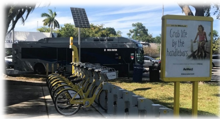
AvMed Rides by B-Cycle Station in Fort Lauderdale. More than 26,000 people have explored Broward cities by B-cycle since the service started, a program that supports Policy T2.5.1

Broward County's multimodal transportation system serves more than 1.9 million permanent residents in addition to seasonal residents, tourists, and commuters. Centrally located in Southeast Florida, the County recognizes that a regional approach is necessary to address transportation needs. Regional transportation systems in Broward, such as Tri-Rail, Florida State Highway System, and Florida Turnpike Enterprise System, are critical for regional commerce. Broward's Fort Lauderdale-Hollywood International Airport and Port Everglades extend the County's reach across the globe as a major gateway for tourism, freight, and business. Local pedestrian and bicycle networks link communities to transit, recreation, education, employment, and entertainment. Each mode of the transportation system is addressed in this Element to achieve an efficient, sustainable, safe, and convenient network integrated with land use and specific to the County's location within the region.