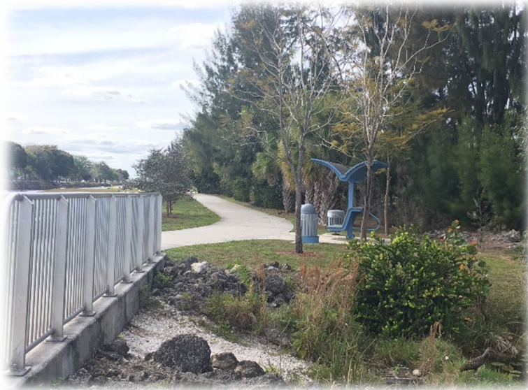
Broward County New River Greenway is an example of a project that supports Goal T1 and associated objectives and policies.

POLICY T1.3.7 Broward County shall continue to coordinate with the Florida Greenways and Trails Council and Florida Office of Greenways and Trails to ensure Broward County greenways are included in the Florida Greenways and Trails System Plan .