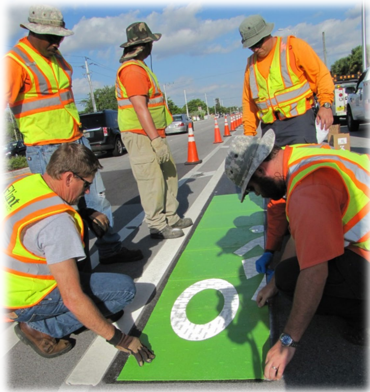
Installation of a green bicycle lane on Bailey Road, another Broward Complete Streets project.

POLICY T1.1.7 Broward County shall support and incorporate into the County’s codes and standards the context sensitive use of “street/traffic calming” techniques; (e.g. reduced vehicle lane width), textured pavement, chicanes, roundabouts, on-street parking, strategic use of differing median types) to enhance multi-modal user safety and accessibility.