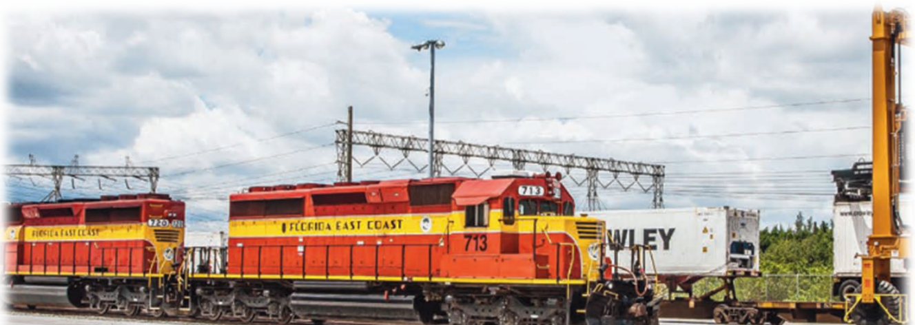
Florida East Coast Railway's Intermodal Container Transfer Facility is credited with increasing cargo volume at Port Everglades.

OBJECTIVE T4.6 Strengthen and foster regional collaboration and cooperation through coordinated planning, operations, and capital investment to ensure efficient freight transportation.