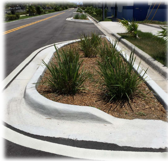
Flagler Drive Bioswale, Fort Lauderdale. Project that supports Policy T1.1.9.

POLICY T1.1.9 Broward County shall support and incorporate into the County’s codes and standards the context sensitive use of techniques to efficiently address streetwater runoff (e.g. swales, planters, vegetated buffer strips, rain gardens, bioswales, infiltration trenches, permeable paving) in a manner that provides ecological, economic, and aesthetic benefits. Additionally, utilities should be placed in such ways to minimize disruption to pedestrian and bicycle travel and to facilitate directing streetwater runoff, planting “Florida Friendly” trees and other vegetation, and siting street furniture, while maintaining necessary access to utilities for maintenance and emergencies.