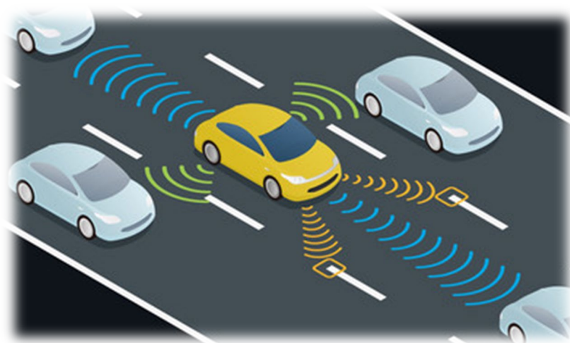
Automated/Self-Driving Vehicles are changing transportation planning. See Objective T2.7 and associated policies.

POLICY T2.7.5 Broward County shall examine best practices and methods for the safe and context sensitive implementation of shared mobility and micromobility solutions, such as dockless bicycle share, dockless scooters, and e-bikes.