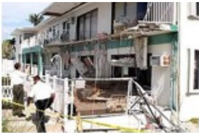
(Above, Right) A 1996 balcony collapse at 4111 S. Ocean Dr., Hollywood, FL

Subsequent building safety inspections shall be required at 10-year intervals from the year the building or structure reaches 25 years of age, regardless of when the previous inspection report for the building or structure was finalized or filed.