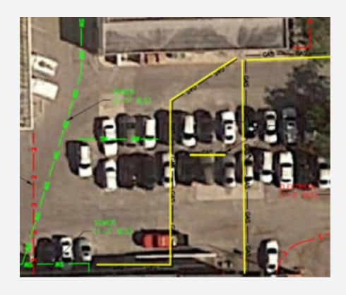
Site #2 GPR