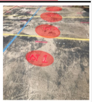
Photo of Location #1. This photo corresponds with the data shot to the left. The red ovals signify the UST's.