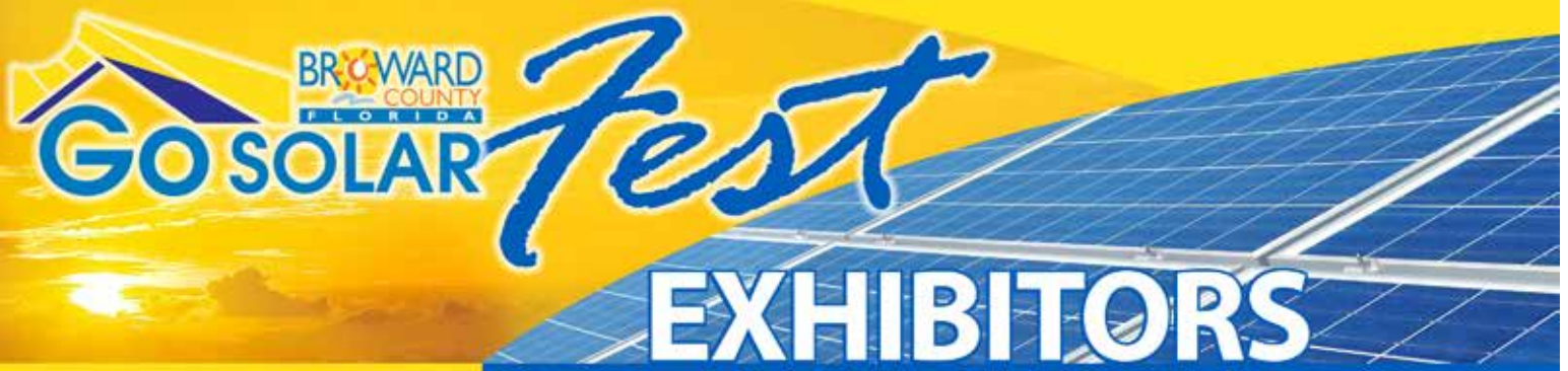
EXHIBIT AT Go SOLAR Fest : Making Solar Work in the Sunshine State!

Include Go SOLAR Fest as a key component of your marketing strategy and gain one-on-one access to key decision-makers. Space is limited, so book early to secure prime space.