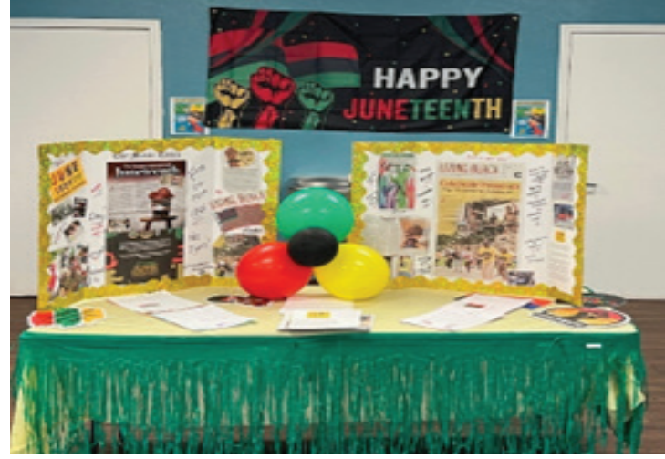
Lafayette Hart Park Summer campers created a display for Juneteenth Holiday. The park also was featured on YouTube in May 2022. https://youtu.be/GHsaN7VDYWU