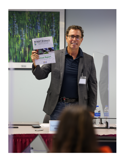
The next Independent Oversight Board meeting is scheduled for Friday, April 29th at 9:30 a.m.